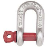
G-210 / S-210

G-210 Screw pin chain shackles meet the performance requirements of Federal Specification RR-C-271F, Type IVB, Grade A, Class 2, except for those provisions required of the contractor. For additional information, see page 468.