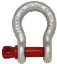
G-209 / S-209

G-209 Screw pin anchor shackles meet the performance requirements of Federal Specification RR-C-271F Type IVA, Grade A, Class 2, except for those provisions required of the contractor. For additional information, see page 468.